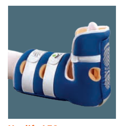
Heelift AFO With a protective rigid rear splint