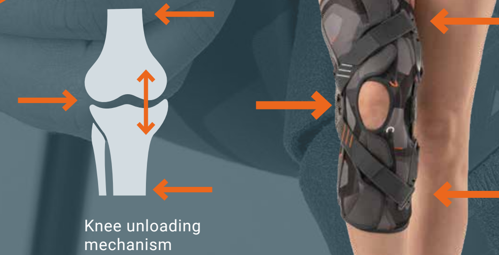
Knee unloading mechanism